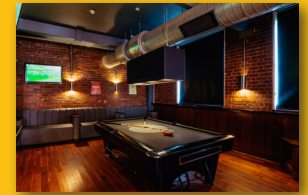
SOUTH-WEST CORNER 20 Capacity Pool Packages available