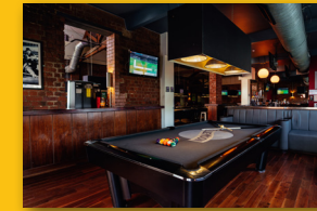
NORTH-WEST CORNER 20 Capacity Pool Packages available