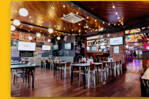
THE BOX 60 Capacity | Private Bespoke Sound