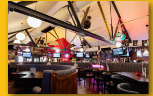
RAISED AREA & DRINKING DEN 40 Capacity