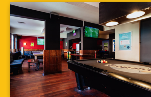
MEMBERS AREA 70 Capacity | Pool | Ping Pong