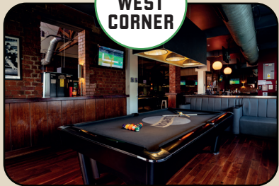
NORTH WEST CORNER

A relaxed space with an American pool table, ample seating, and the ability to combine with the Darts Area for ultimate entertainment.