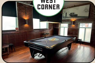
SOUTH WEST CORNER

A cosy, stylish space with private screens and bar access, perfect for intimate gatherings or small celebrations.